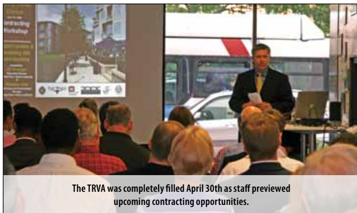
The TRVA was completely filled April 30th as staff previewed upcoming contracting opportunities.

The TRVA will continue to host workshops and other events to keep contractors informed of upcoming opportunities throughout the project timeline. Be sure to visit www.trinityrivervision.org and click the Online Vendor Registration link to sign up for notifications.