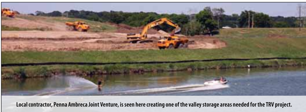
Local contractor, Penna Ambreco Joint Venture, is seen here creating one of the valley storage areas needed for the TRV project.

Over the last quarter, more than $3.4 million in construction contracts have been awarded. Penna-Ambreco Joint Venture, a certified small business, received a contract award from the United States Army Corps of Engineers (USACE). This is the first construction contract awarded on this project by the USACE and will cover eco-