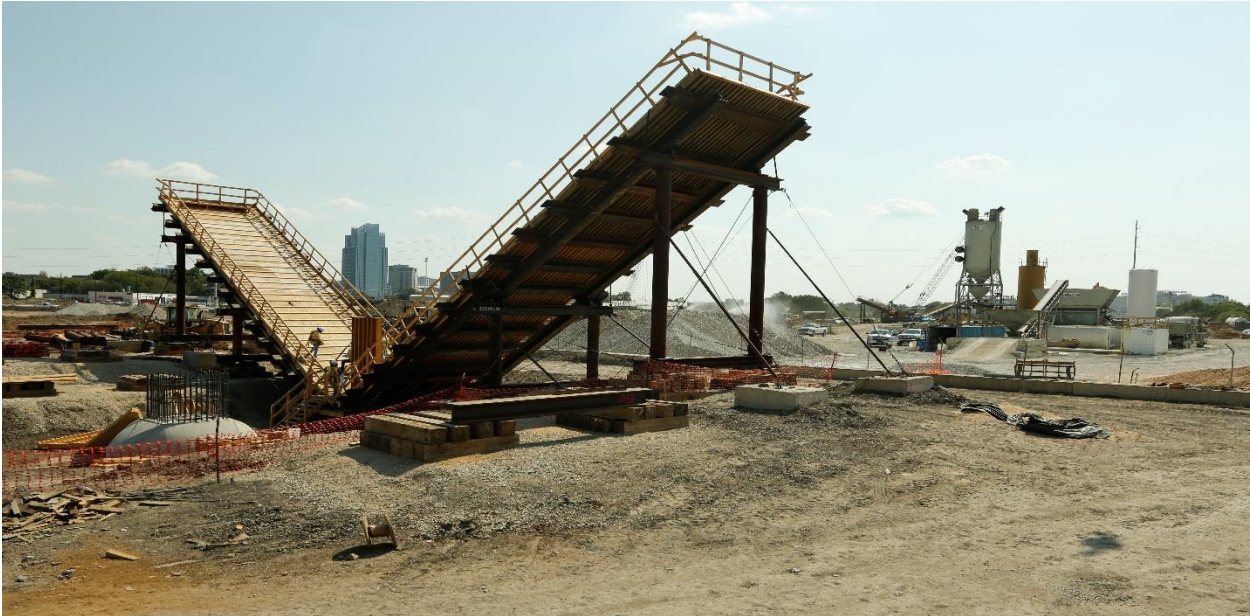
(Henderson Street Bridge construction)