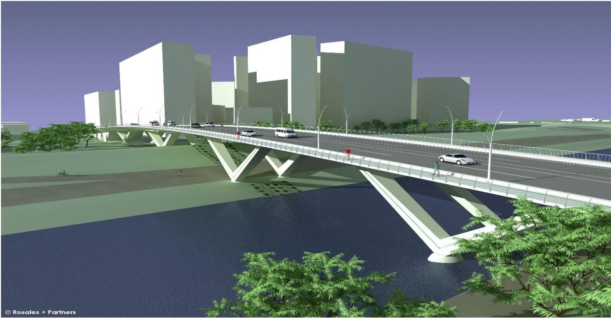
(Henderson Street Bridge concept)

As of 2015 fiscal year-end, the District and TRVA have spent a total of $64.4 million on this project. The City of Fort Worth Tax Increment Reinvestment Zone Number Nine in accordance with the project cost funding agreement as described in Note 1, which accompanies the financial statements, has spent $144.1 million on the project and has an outstanding loan of $124.3 million with the District. Pictures depicting the concept for the Henderson Street Bridge and the construction progress on the Henderson Street Bridge during fiscal year 2015 are shown below.