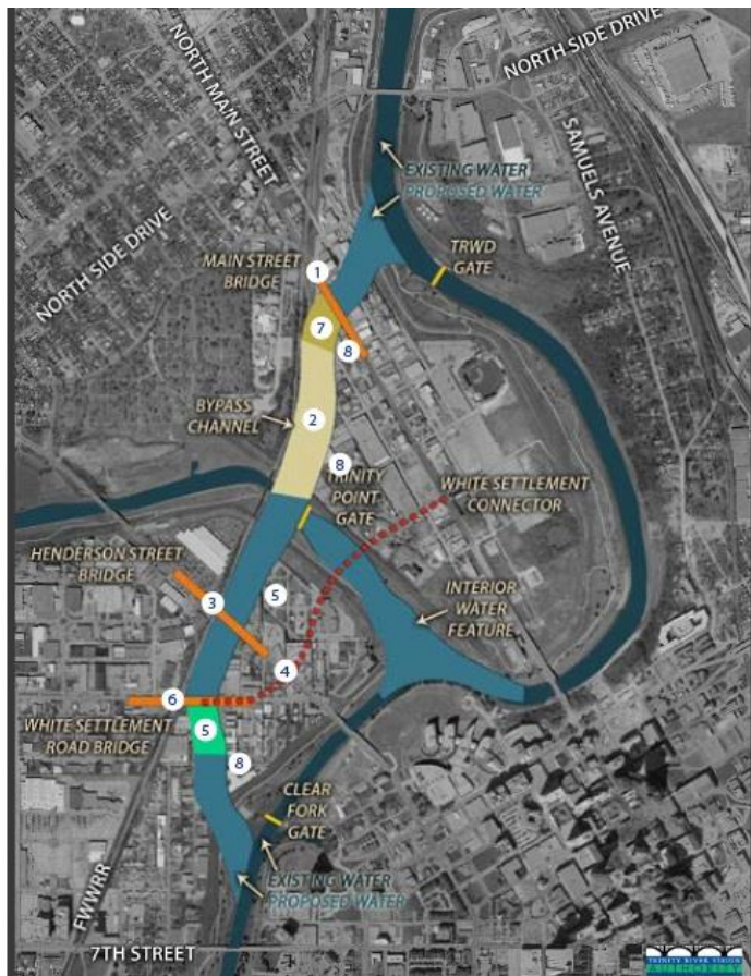
(Fiscal year 2015 progress map)

Design work for valley storage at Gateway Park Sites A & C was completed during fiscal year 2015. The construction portion was bid and awarded in fiscal year 2015 and construction will begin in fiscal year 2016. The design work for Riverside Park is 98% complete at the end of fiscal year 2015. The bypass channel is in the final design phase and design work on the pedestrian bridges is 60% complete.